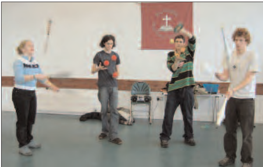
The photograph shows some of the club members practising their skills

Offer circus skills, object manipulation and fun every Saturday morning 11 – 1 at the Brixworth Community Centre. In particular they do juggling of balls, clubs, rings and staffs, as well as poi unicycle, contact, diabolo, balance and lots more. Entry - £2